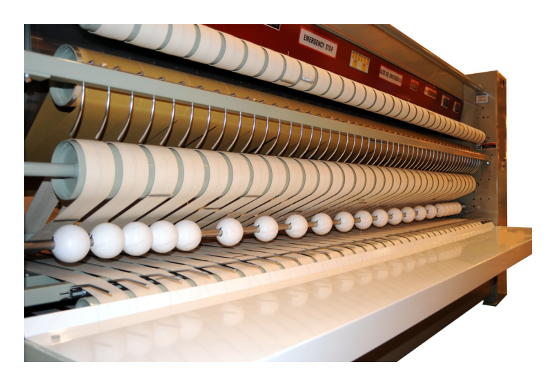
Front View of the OSB Smooth Fold System

The OSB provides a crisp and smooth primary fold. The OSB system keeps the linen tight as the IFC or IFCS makes the primary folds.