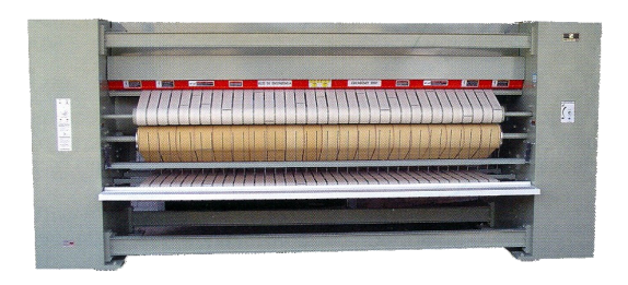
Model 3600 Ironer

NOTE: All of the models covered in this brochure have separate Technical Data and Installation Dimension brochures giving detailed information.