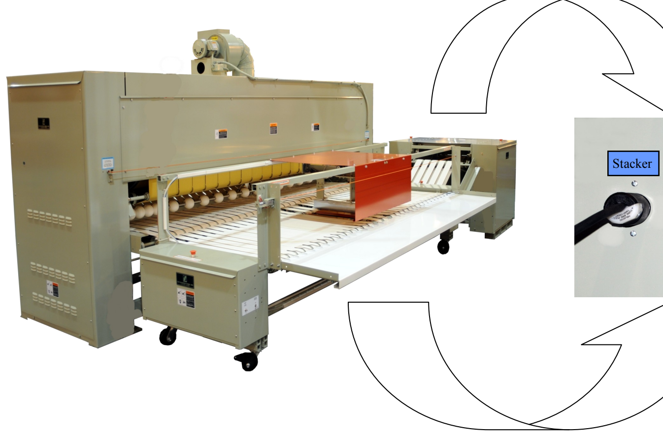
The "S" in IFCS